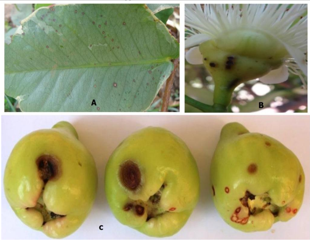
Fig. 1: Malayan apple showing the symptoms of anthracnose on (a) Leaf, (b) fruits, (c) flower under natural conditions

Int. J. Pure App. Biosci. 5 (5): 465-472 (2017)